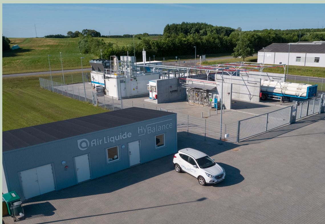
HyBalance demonstrates the use of hydrogen in energy systems