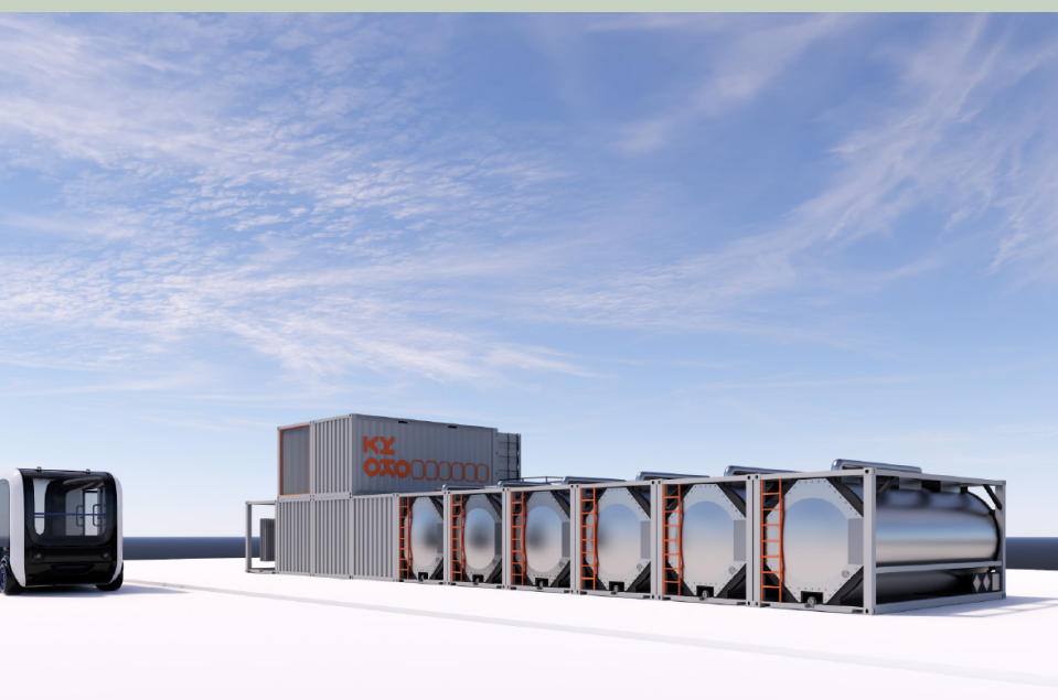
Heatcube will be installed at Nordjyllandsværket Visualization: Friis & Moltke Architects

The ambition is to create a vibrant area for world-class innovative green solutions and lead the way within future energy testing and technology. Furthermore, Nordjyllandsværket is to encourage partnerships and triple helix collaborations as new circular resource flows are tested and proven – pushing forward the green transition.